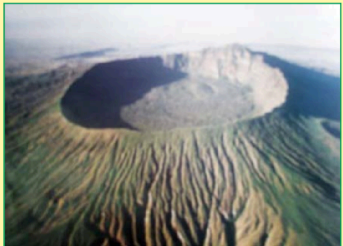
The Famous Ngorongoro Crater