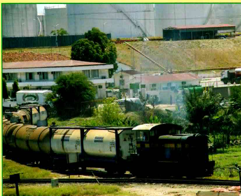
Rail transport in Dar es Salaam