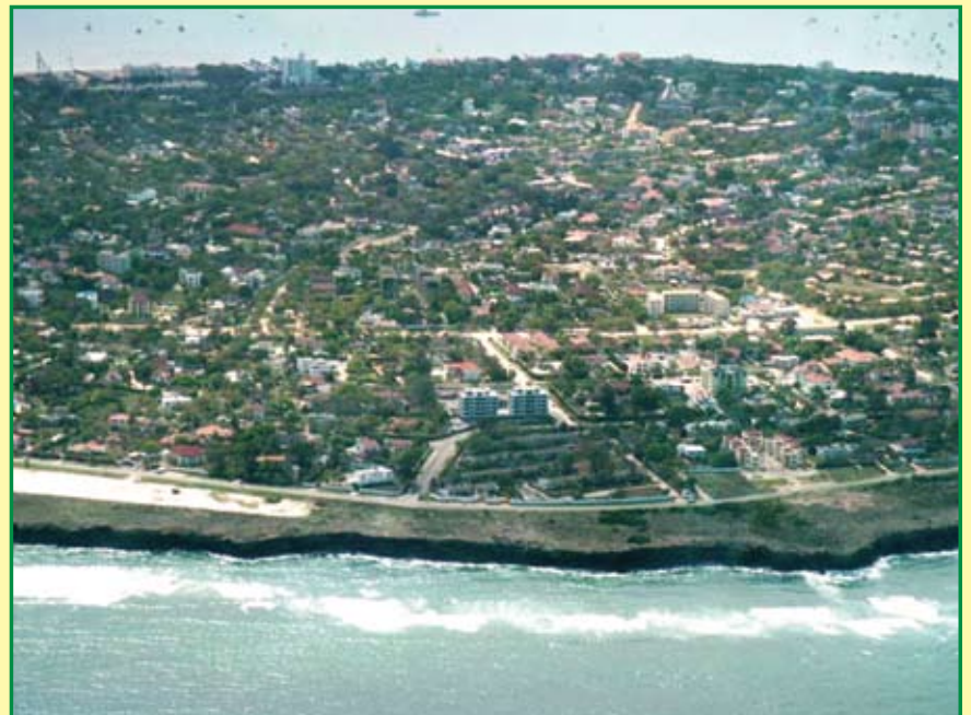
Aerial view of Dar es Salaam city