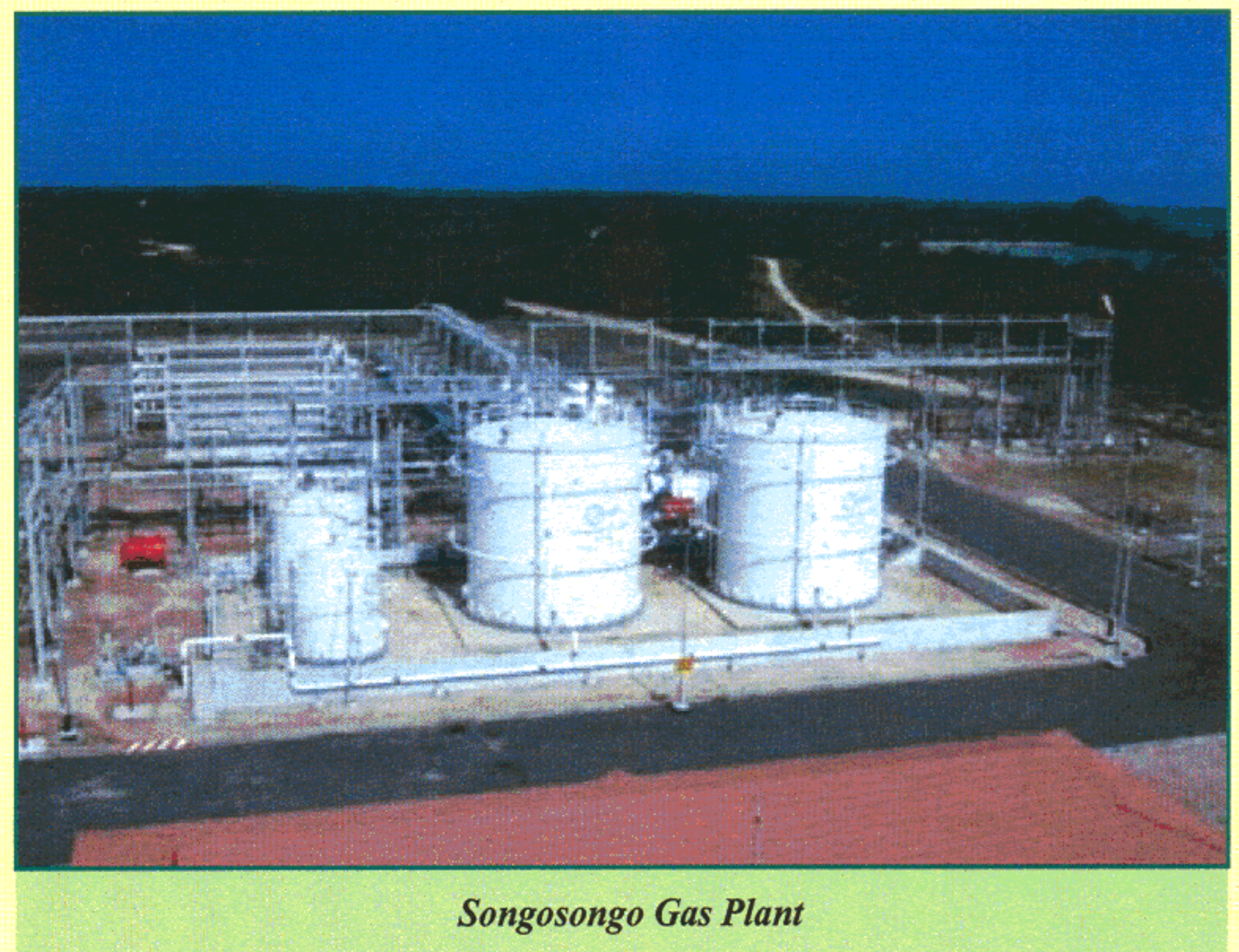
Songosongo Gas Plant