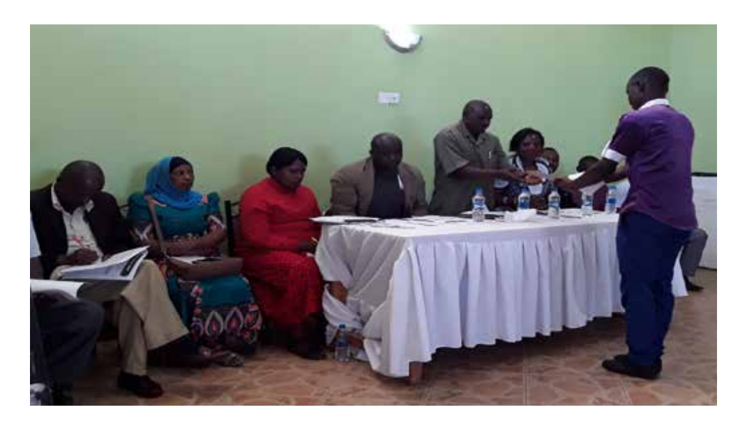
The photo shows one of the youth representative submiting the presented statement to the guest of honor at Mbozi district.