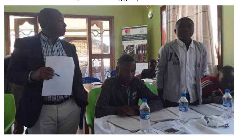
Youth standing (right hand side) asking the duty bearers (LGA officials) on how are they going to solve marketing challenges in Mbozi district.