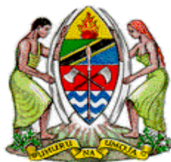
United Republic of Tanzania

This publication was supported by: The Government of the United Republic of Tanzania and African Capacity Building Foundation (ACBF)