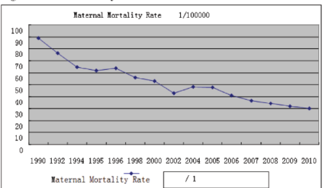
Fig.1: Maternal Mortality Rate

• Popularizing Compulsory Education: Compulsory education (established in 1986) played a key role in transforming the large population into rich human resources, and the subsidy policies to rural