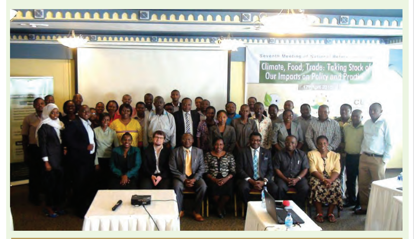
Participants in a group photo during the 7th and Final National Reference Group Meeting of the PACT EAC Project on "Climate, Food, and Trade: Taking Stock of our Impacts on Policy and Practice in Dar es Salaam. Held on 17th April 2015.

Among other activities conducted by the department include the training of CSO's on Evidence based advocacy, and Monitoring and Evaluation in the context