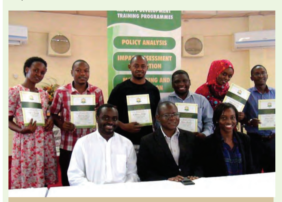
Some of the participants who completed the five days course on Impact Evaluation held at ESRF Conference Hall from 1st -5th June 2015.

Capacity on 13th May 2015, focused on critically Development Department (GCDD) has analyzing the implication of the 2014/15 continued to focus its efforts on building budget on Education and Agriculture