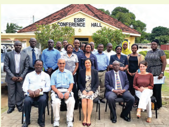
Participants of the Get Energy VTEC Oil & Gas, at ESRF Conference Hall in March 2015.