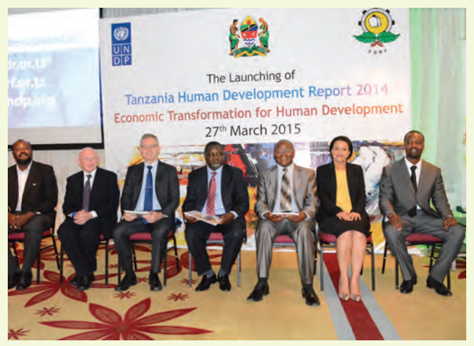
Group photo of the High-Table Delegates at the Launch of Tanzania Human Development Report (THDR) 2014.