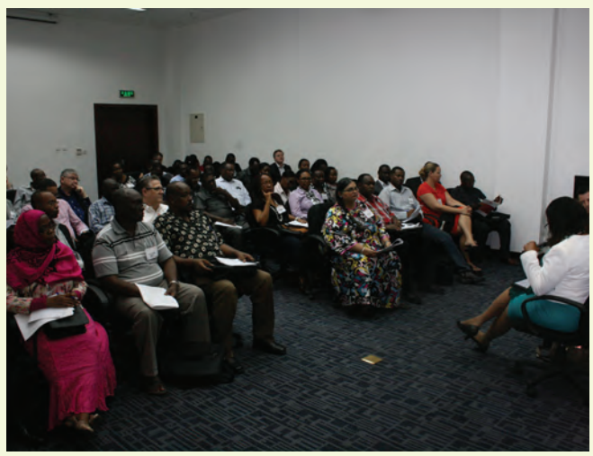
A cross section of Participants of the Pan-African Conference on Oil and Gas Conference at British Council Auditorium.